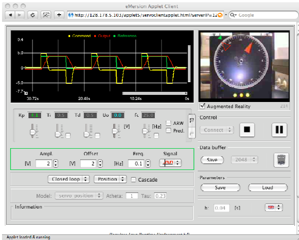
Figure 3. the client application implemented as a java applet

The main adjunctions to the distant application that locally control the physical equipment (Fig 2) are the video acquisition and transmission layer that allows remote clients to communicate with the online experiment. With these additions the local application becomes a server application. Additional requirements and best practices are presented in [4].