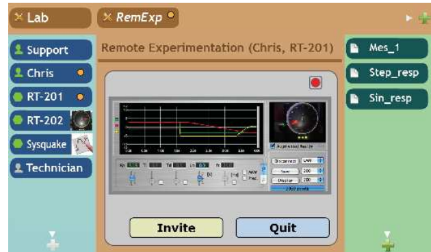
Figure 4. Remote experimentation agent in elogbook

equipment RT-201 within the elogbook {ref]} collaborative environment. The measurements acquired with the help of the agent (center of Fig. 4) are directly saved within the shared space (right column of Fig. 4) and are be visible by the members (left column of Fig. 4) of the given activity (top of Fig. 4). The agent has been granted the right to directly save measurements in the shared space after it authenticated using the provided elogbook mechanism.