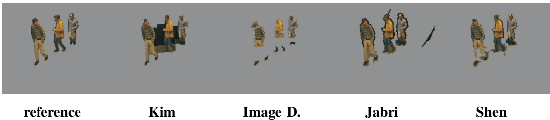
Fig. 2. Sample frames for the reference and some segmentation results of the tested video sequence 'Group' (frame #100).

contours. Figure 1 (e) shows a sample frame for 'Highway'.